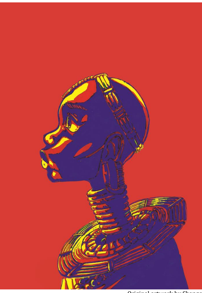
Original artwork by Shango

One of my favorite manga of all time, One piece is one big grand adventure, entertaining through and through! Follow Luffy, a young pirate as he builds his crew of crazy individuals in search of the ultimate treasure, One Piece! It will tickle your heart with its crazy art style and wacky personalities. One of the longest running manga it will be hard to run out of reading! It will be able to fill up your time and outlast this lockdown! The world of this story is so big and can offer a great escape from the 4 walls of your reading room.