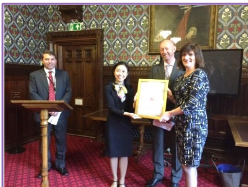
DGS was awarded Sakura Network membership in front of MP Gareth Johnson, a DGS alumni, and Nicky Morgan, the Secretary of State for Education