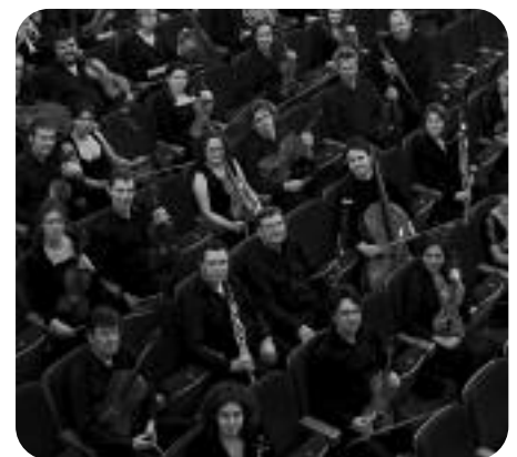
English Chamber Orchestra

For more details see www.englishchamberorchestra.co.uk