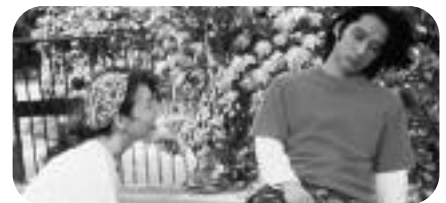
Licence to Live (1999)