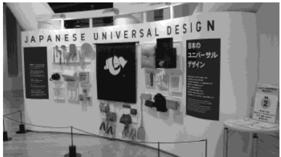
The Toyota Universal Design Centre, Tokyo

Indeed, a key message of inclusive design is that if it is well designed for older and disabled users, it generally results in a much better-designed product for everyone. In the retail sector, some department stores, such as Matsuya in Tokyo, are now offering well-designed and attractive 'inclusive' products in amongst other desirable goods. These say more about lifestyle choice than about age or