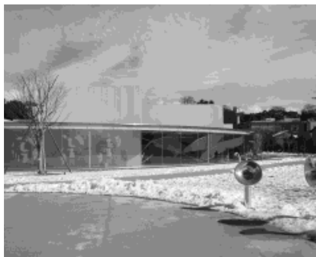
21st Century Museum of Contemporary Art in Kanazawa

The economic downturn that succeeded the 'bubble' economy has meant that many museums now face deregulation, with some uncertainty as to their future roles. But they continue to mount ambitious exhibitions that chart recent developments in contemporary practice and review key artists and movements in 20th century art. Among the most interesting surveys on show was Traces , on tour from Kyoto to Tokyo's National Museum of Modern Art, which explored performative actions and gestures in object-based works made between the late 1940s and 1970s, bringing together artists such as Pollock, Fontana, Morris, Lee U Fan, Hitoshi Nomura, Shimamoto Shozo and Jiro Takamatsu among many others; as well as Yayoi Kusama's comprehensive retrospective at the National Museum of Modern Art in Kyoto. Contemporary exhibitions included Yukiko Nishiyama's first major solo exhibition at the Osaka Contemporary Art Centre, the venue providing an apposite context for Nishiyama's explorations of individual and collective identities as fleeting and mutating. A number of solo and group exhibitions focused on contemporary photographic practice, such as Yuki Onoder's symbolic, poetic and visually ambiguous portraits or snapshots of the everyday made strange on show at the National Museum of Modern Art in Osaka. A large survey of women artists at the Museum of Contemporary Art in Tokyo included Tomoko Sawada's witty self portraits in a variety of