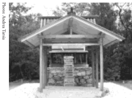
Hill-top temple by Hiroshi Sugimoto, Benesse Art Site, Naoshima

points to the temple as a model in its evocation of the sublime.