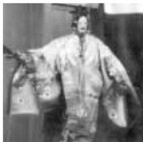
The ‘Angel’ or ‘Heavenly maiden’ in the Noh play Hagoromo (Feather Robe)