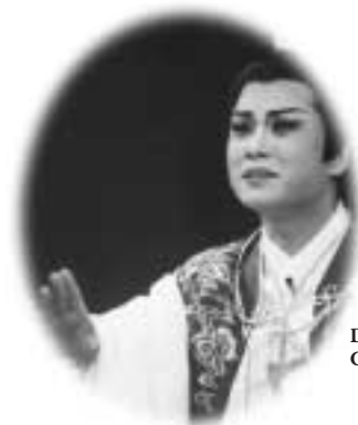
Dream of the Red Chamber, China

Across the weekend of February 21st-23rd 2003, the Place Theatre will play host to four leading performers in the ancient theatrical art of female role play: the Japanese call it onnagata and the tradition itself is equally precious to the four countries of China, India, Indonesia and Japan. The Japan Foundation is bringing those countries to the UK in the exotic form of Zhao Zhigang from China, a star actor on the Yueju-Yue opera scene; India's Pandit Gopal Dubey, a master in the art of the masked dance of Chhau; Didik Nini Thowok of Indonesia, unique in his exploration of the female role from Java to Bali; and Japan's Gojo Masanosuke, who will be dancing the classical Nihon Buyo but is also devoted to creative modern dance.