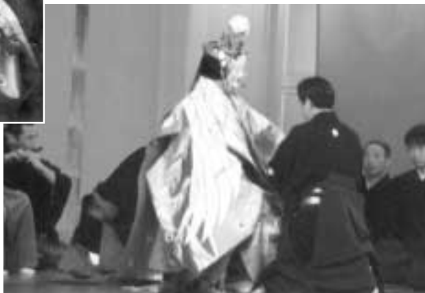
The ‘Angel’ makes a costume change (monogi) in full view of the audience