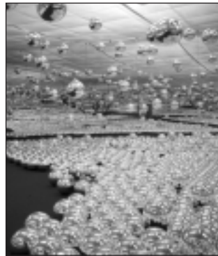
Photograph: Yayoi Kusama Narcissus Garden Silver balls . Collection of the artist