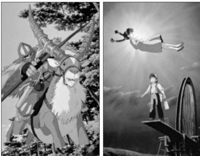
Characters from Princess Mononoke (left) and Laputa: Castle in the Sky

Studio Ghibli grew out of the vision of two men, Hayao Miyazaki (born 1941) and Isao Takahata (born 1935). As the leading Ghibli directors, Miyazaki and Takahata concentrate on separate projects, though they frequently produce each other's films and help out in other capacities. In general, Takahata's films look wistfully back to a 'golden age' defined by their lead characters who try to recreate it, and Miyazaki's works suggest that the time for focussing on yesterday is past, and we have to do the very best we can with the here and now. Both directors are similarly unafraid of fantasy and view it as an essential component of the human spirit. The resulting synergy and continuity is Studio Ghibli's strength.