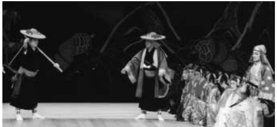
Scene from Manzai Tekiuchi

Tickets can be obtained from the Peacock Theatre box office only: Tel: 020 783 8222.