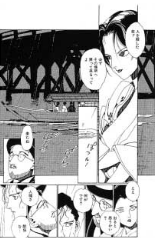
Akihiro Yamada's Oboro tanteicho Tokyo sanscisha, 1991 from the "Japanese Manga" travelling exhibition